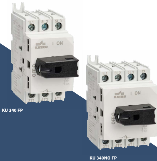
KU 340 FP

The front plate is an excellent accessory for the KU series switches, especially when a compact structure, clean installation, durable functionality, and auxiliary contact solutions without additional space requirements are needed. Front plates are available for both 3- and 4-pole KU switches.