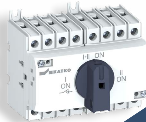
KU 440CT closed transition changeover switch + CT40KU4P changeover kit, 1-1+2-2